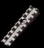
Forearm Picatinny Rail