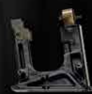
9mm Magazine Adapter