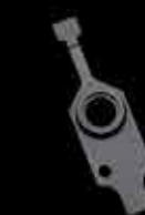
Sight Adjustment Tool