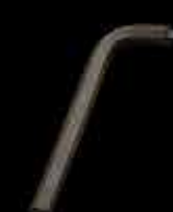
Barrel Wrench Tool