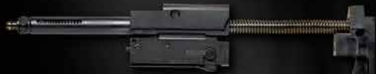
Blowback Recoil Assembly