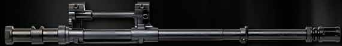
9mm Luger Parabellum (9x19mm) CHF CrMoV Barrel, 1:10 RH