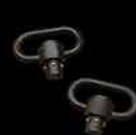
1/4" QD Sling Swivels