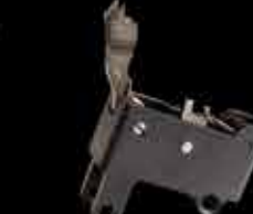
Fire Control Pack – Complete