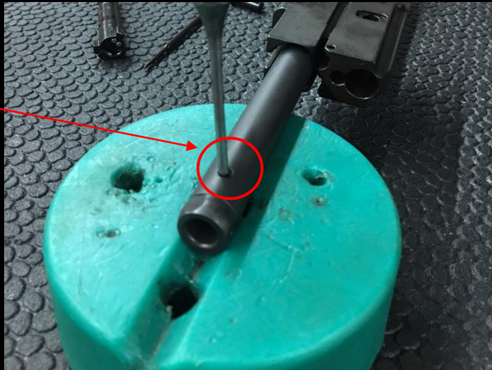
Return Spring Retaining Pin